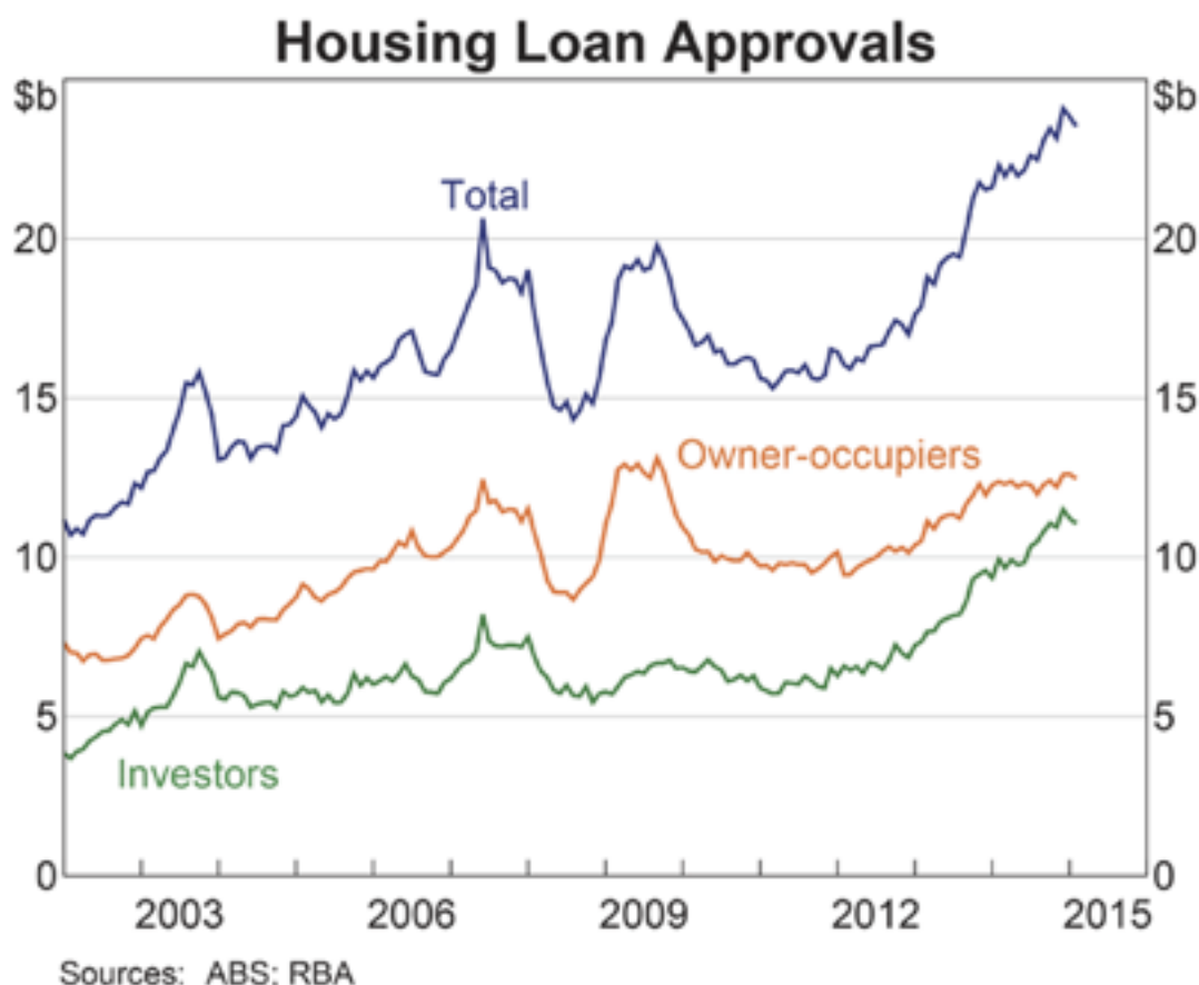
Figure 2 3

The current 50% CGT discount, introduced in 1999, has produced a massive increase in investment in housing without a commensurate increase in supply. Over 92% of investment in housing goes to existing rather than new housing 4 , creating inflationary pressure and helping to reduce the proportion of owner occupation, especially for first time buyers. The proportion of investors to first time buyers has risen steadily since the introduction of the 50% CGT exemption in 1999.