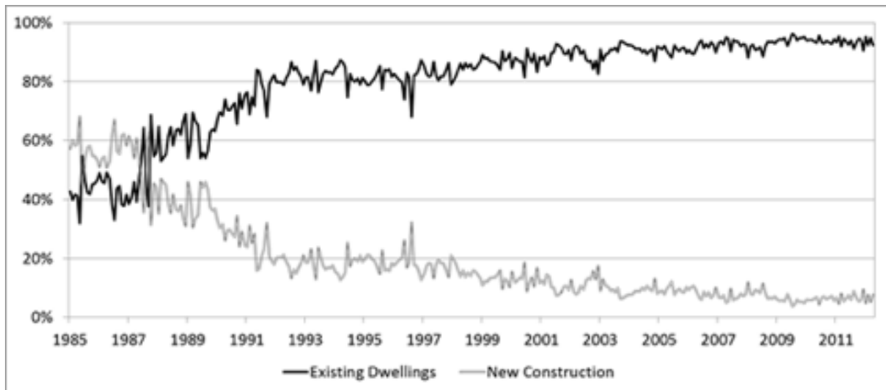
Figure 3 8

When we look at rent prices between 2006 and 2011, we find that rents actually rose by over 50% and at twice to three times the rate of CPI. 9